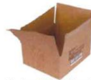
Cardboard (flatten all boxes) Paper bags