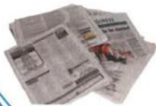
Newspaper & Inserts