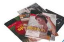
Magazines & catalogs