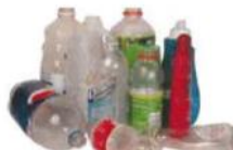
Plastic bottles & containers