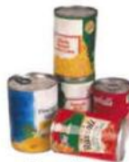
Tin or steel cans