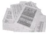
Office paper & file folders